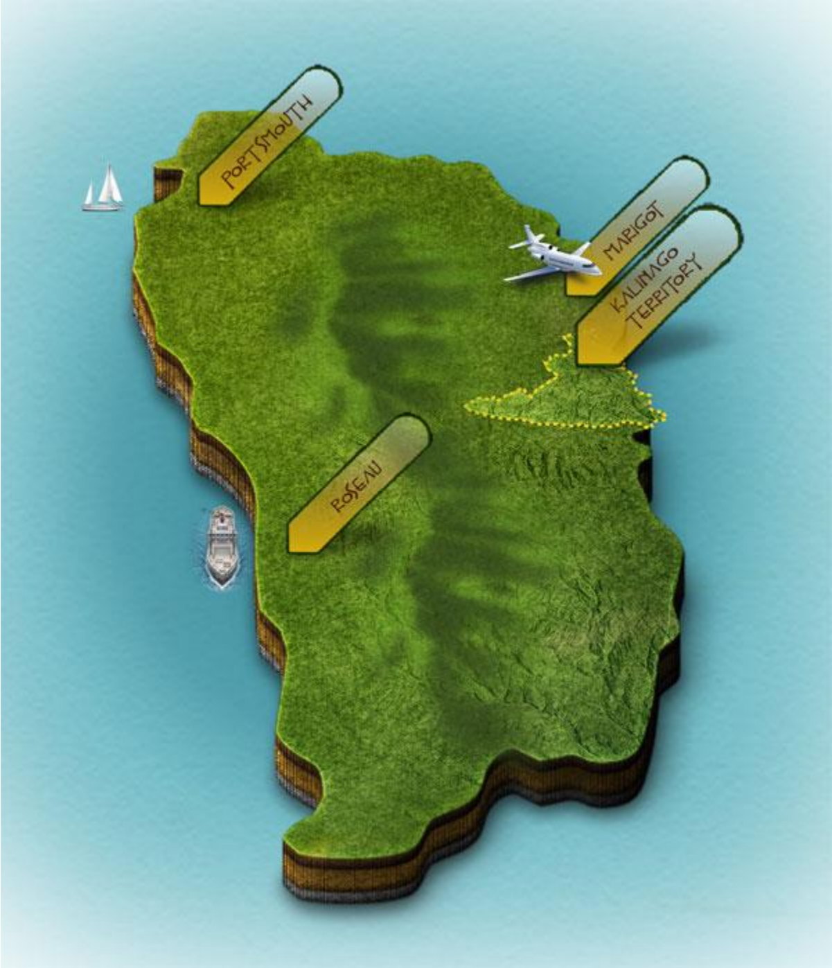
Figure 1: Map showing Location of Kalinago Territory

when avoidance is not feasible, minimize, mitigate or compensate such effects; and the project shall ensure that IPs receive social and economic benefits that are culturally appropriate and gender and inter –generationally inclusive.